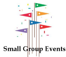
Small Group Events