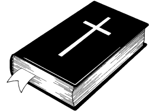
Daily Bible Readings for the Summer

Mon., Aug. 1 - Deuteronomy 8:1-10 Tue. Deuteronomy 26:1-15 Wed. Matthew 15:32-39 Thu. Exodus 16:2-15, 31-35 Fri. Acts 2:37-47 Sat. Psalm 78:1-8, 17-29 Sun., Aug. 7 - 1 Kings 19:9-18, Psalm 85:8-13, Psalm 105:1-6, 16-22, 45b, Romans 10:5-15, Matthew 14:22-33 Mon. Genesis 7:11-8:5 Tue. Genesis 19:15-29 Wed. Matthew 8:23-27 Thu. Job 36:24-33; 37: 14-24 Fri. Romans 9:14-29 Sat. Psalm 18:1-19 Sun., Aug. 14 - Isaiah 56:2, 6-8, Psalm 67, Psalm 133, Romans 11:1-2a, 29-32, Matthew 15:10-28 Mon. 2 Kings 5:1-14 Tue. Isaiah 66:18-23 Wed. Matthew 8:1-13 Thu. Acts 15:1-21 Fri. Romans 11:13-29 Sat. Psalm 87 Sun., Aug. 21 - Isaiah 51:1-6, Ps. 138, Ps. 124, Romans 12:1-8, Matthew 16:13-20 Mon. 1 Samuel 7:3-13 Tue. Deuteronomy 32:18-20, 28-39 Wed. Matthew 26:6-13 Thu. Isaiah 28:14-22 Fri. Romans 9:30-10:4 Sat. Psalm 18:1-3, 20-32 Sun., Aug. 28 - Jeremiah 145:15-21, Psalm 26:1-8, Psalm 105:1-6, 23-26, 45c, Romans 12:9-21, Matthew 15:21-28 Mon. 2 Samuel 11:2-26 Tue. 2 Samuel 11:27b-23:15 Wed. Matthew 12:22-32