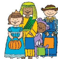
Trunk or Treat West Parking Lot on Sunday (30)