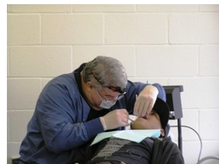
The Dentist visits Pathways