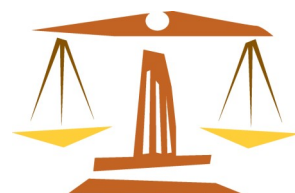
Justice and Peace

Opening Session begins at 7 p.m. New York Presbyterian Church, Sat. & Sun. plenary sessions and workshop, ecumenical worship and denominational fellowship: Lobby Day preparation. On Saturday evening, March 26, a dinner cruise aboard The Celebrity on the Potomac River. The event will include music provided by a jazz combo, a delicious meal, and the opportunity to see our Nation's Capital in all its glory during the early days of the Cherry Blossom season. Cost for the training $175.00 (includes all sessions, two lunches, and a Sunday reception). Dinner cruise $40. Call 202-997-8024.