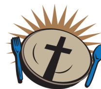
Lenten Prayer Meetings