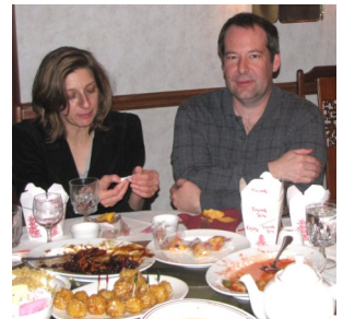
The Chinese Dinner